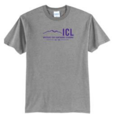
Back is plain