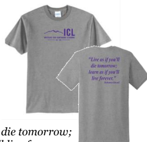
Live as if you'll die tomorrow; learn as if you'll live forever.