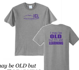
I may be OLD but I'm still LEARNING

T-Shirts will be available for purchase at the Course Previews and Ice Cream Social