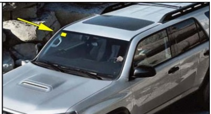
Vehicles with roll-down rear windows and convertibles